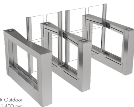
EasyGate SPT-R Outdoor 1 400 mm