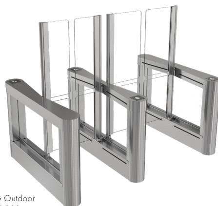
EasyGate SPT-G Outdoor 1 800 mm